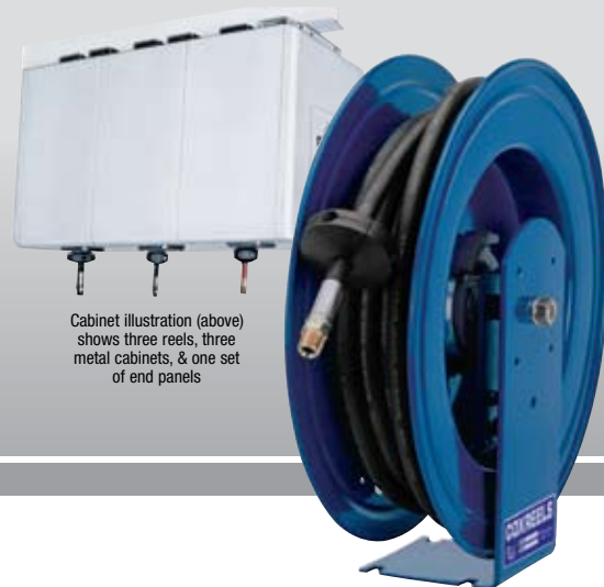
Cabinet illustration (above) shows three reels, three metal cabinets, & one set of end panels